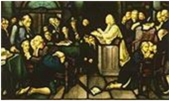
The Prayer in the First Congress, A.D. 1774